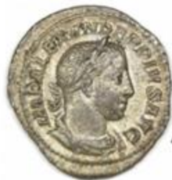
Alexander Severus A.D. 231-235